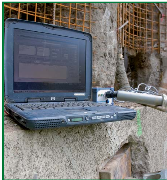
Checking of the tensioning process of the ground anchor

A part of the monitoring was the measurement of forces in selected ground anchors on the constructions 9515 Myslbekova – Prašný most and 0080 Prašný most – Špejchar. The aim of this measurement is to check the calculated force values in ground anchors and the process of deformation of the excavation walls. The measured anchors were chosen from a set of anchors in the relevant wall to enable an overall checking of this wall. The total number of ground anchors intended for observation was 116. Magnetoelastic sensors DYNAMAG were used for this measurement. These sensors use the change of magnetoelastic characteristics of material during the change of its mechanic tension. The sensors measure the change of magnetic flux in the strands of the ground anchor in dependence on their tension. The anchors with 3-8 strands and forces 300-1100 kN are measured on this construction.