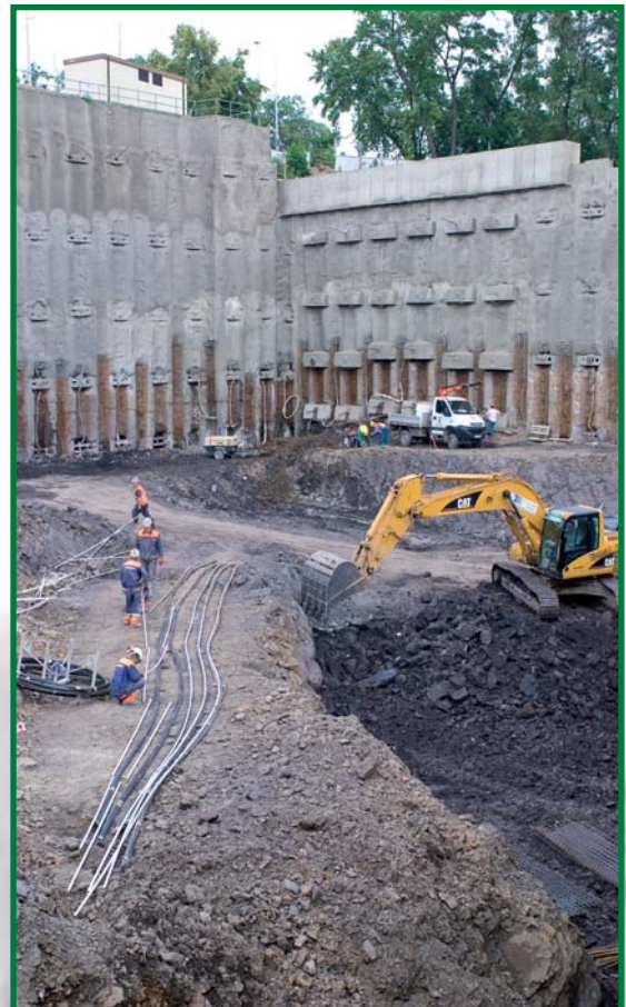
Construction of Prague Ring Road, part Myslbekova – Pelc Tyrolka