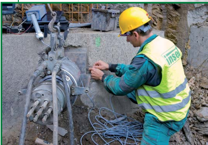
Adjustment of connecting cables