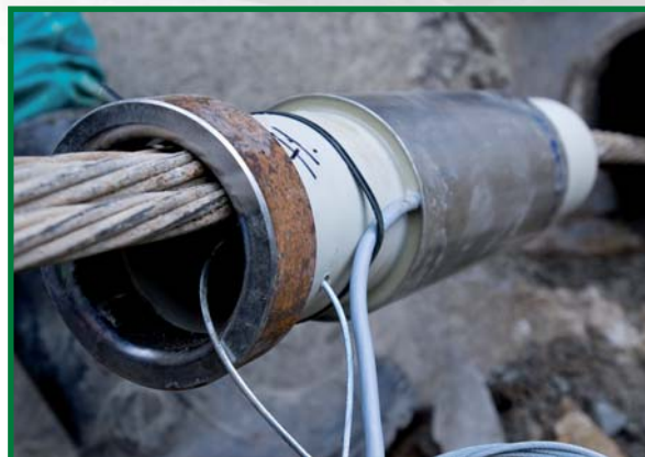
Magnetoelastic dynamometer Dynamag

INSET s.r.o. , Divize Ostrava Rudná 21, 700 30 OSTRAVA, Czech Republic Phone: +420 596 123 565, fax: +420 596 115 832 E-mail: dynamag@inset.com, www.inset.com