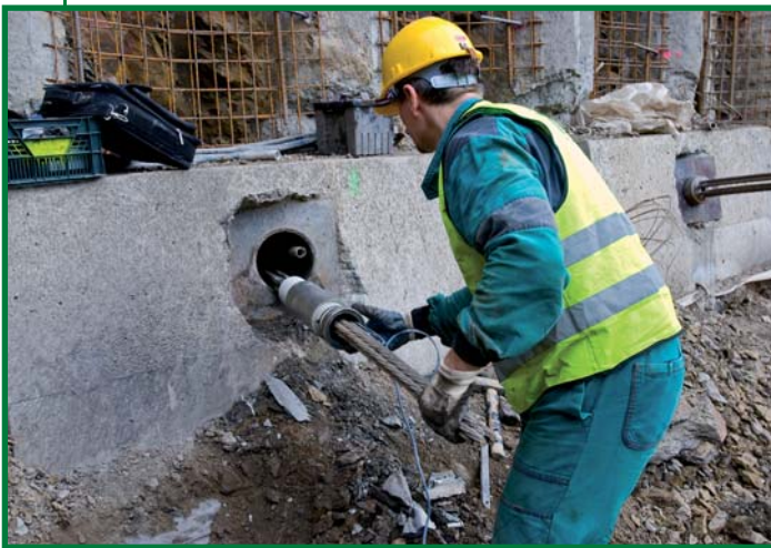
Sensor installation on a ground anchor

The measuring of force development in ground anchors and the geodetic methods for measuring of the of anchor head position are used to check the stability of the constructions, i.e. the security of the tunnel excavations, and to verify designer's static calculations.